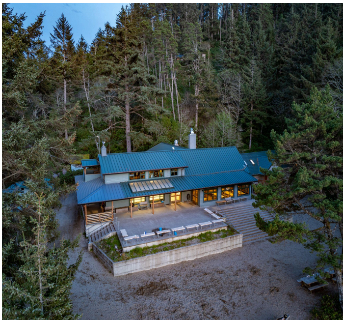
Wilson Lodge.

During all rentals the Site Staff retains the right of entry to all areas, facilities, buildings, etc. for the specific purpose of maintenance duties, and/or in case of unlawful activities not in compliance with the safety and camp guidelines or which are not in the best interest of the upkeep and maintenance of Camp Westwind.