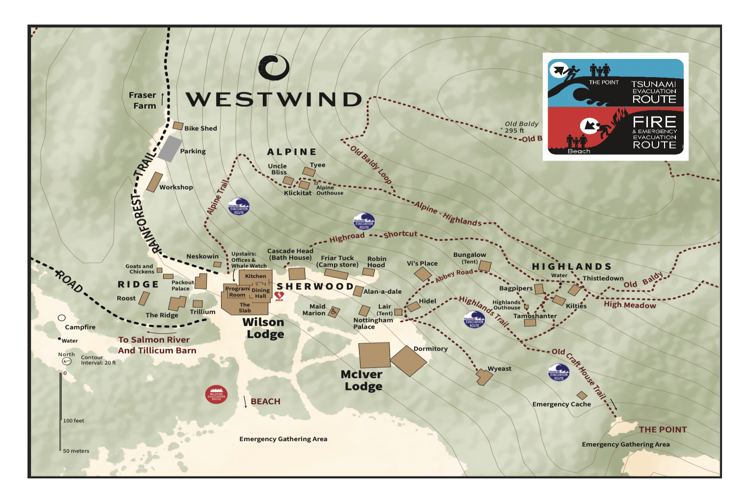
Westwind 2025 Reservation Information Packet