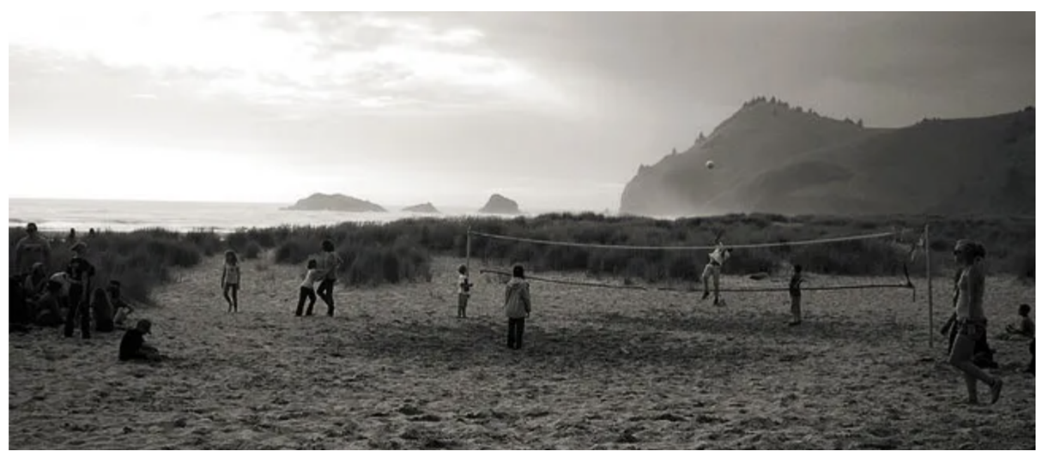
Westwind 2025 Reservation Information Packet

Gaga Ball at Tillicum barn: If you have never played GaGa Ball, you're missing out. Gaga ball is a fast-paced, high-energy game that's played in an octagonal or hexagonal pit and combines elements of dodgeball, handball, and striking.